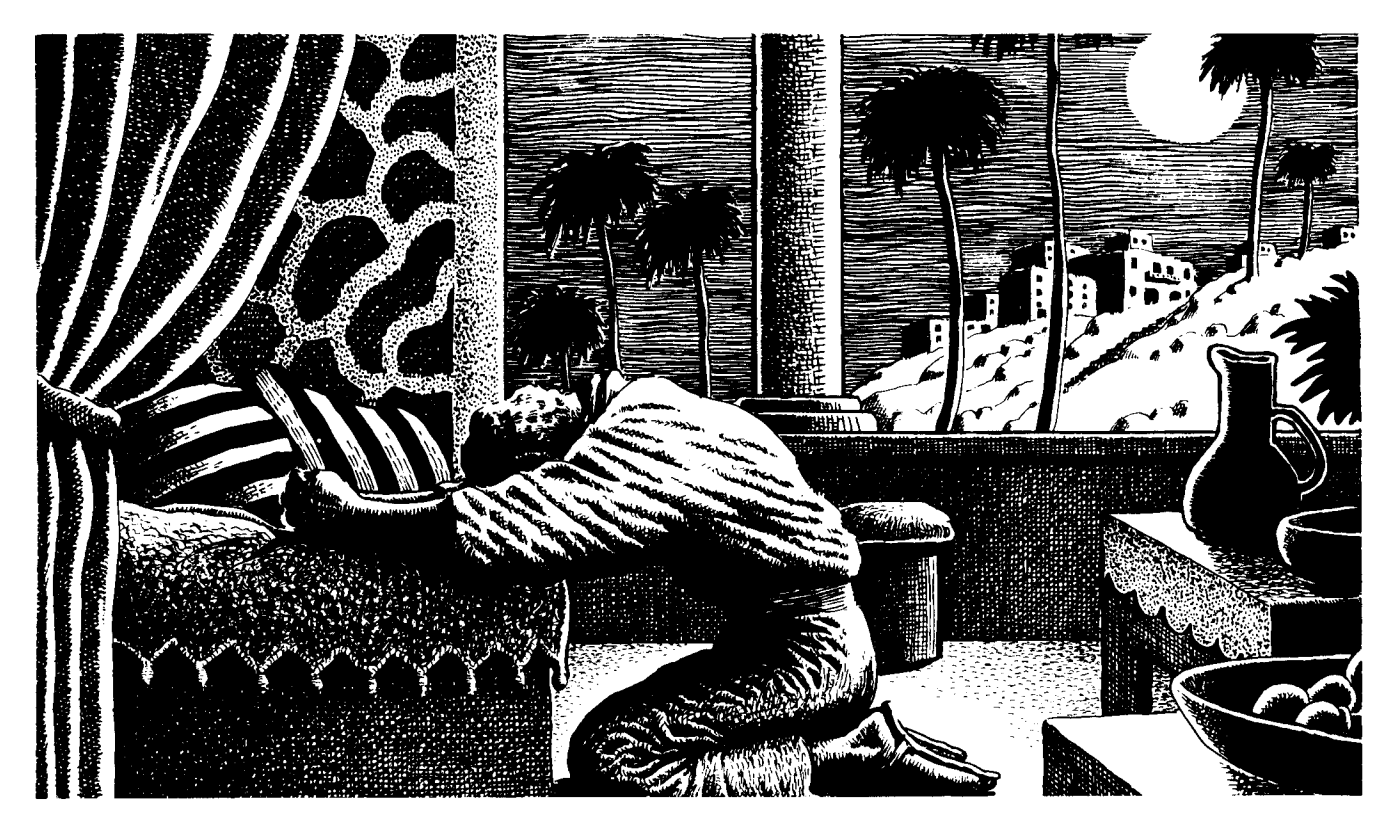
Samuel prayed to God about the peoples' demand for a king.

appearance. But what qualities does God notice? Look up I Samuel 16:7 and complete the quote: ''... for the Lord _______ not as _______ on the ______ appearance, but the Lord ______ on the