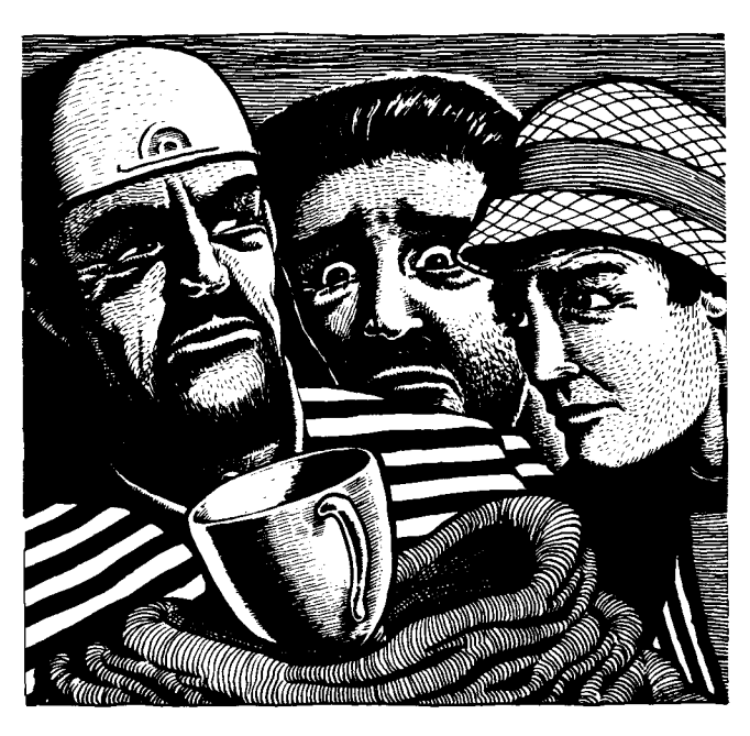
Joseph's servants looked into Benjamin's sack, and there was the missing silver cup.

The brothers had no choice but to return to the