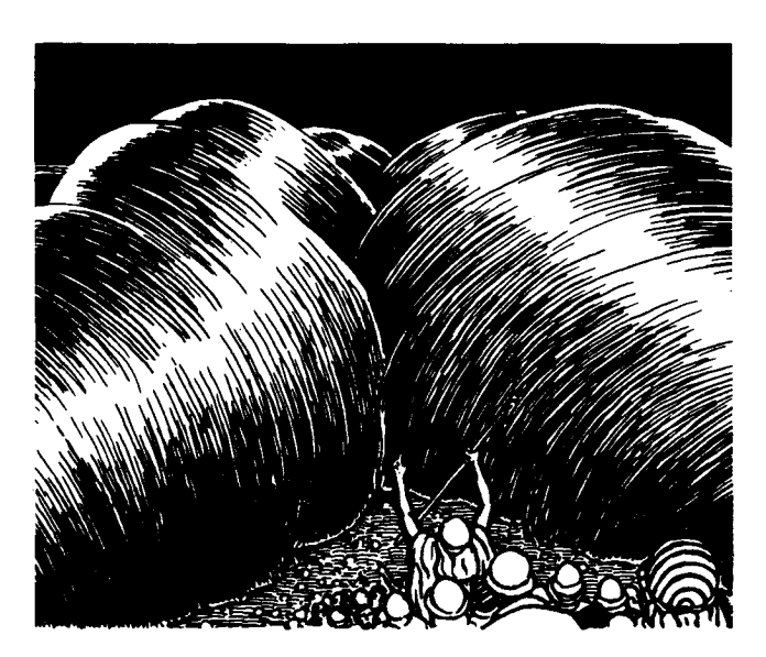
Roaring like a gigantic waterfall, the water began to roll back before Moses' outstretched arms!